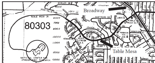
NCAR. Usual site of monthly SSB meetings.

You will need to start building your soaring library by purchasing the following books (available from the Soaring Society of America) Solo - Tom Knauff, After Solo - Tom Knauff, SSA Handbook , and a Sailplane Pilots Logbook . A hat, sunscreen, water bottle, note pad, pens, small flight case, Denver and Cheyenne sectional maps are good to have before your first flights.